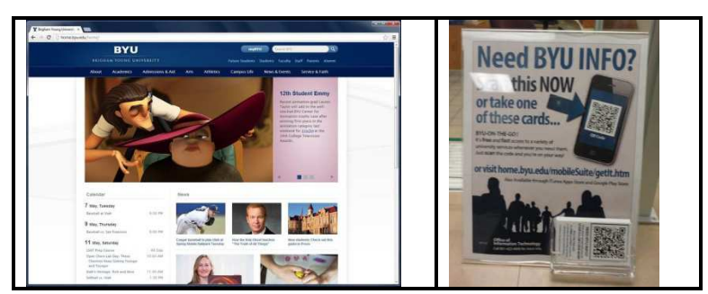
Figure 4 Effective Electronic Adverts

Another finding was that the library should move its advertising out of the library. Suggestions included, "Students like to study in places other than the library so they may never see the advertising which is in the HBLL" and "It kind a defeats the purpose when they have the ads playing in the library on the TV that's in the library. Obviously, if you didn't know about the library you wouldn't be there." Since one of the reasons for promoting library resources is to get the students to use the library, placing the ads inside the library does seem to be an ineffective strategy.