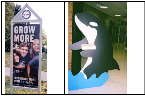
Figure 3 Effective Print Adverts

Repeated, varied, and creative efforts sustained the attention of students. As Dyal and Daniel (2010) claim, "multiple venues and variations for the same message are the only ticket to success—and even then,... [are]dicey if we have not created a compelling message." The university Office of Research and Creative Activities (ORCA) has successfully and repeatedly used a cut-out of an orca whale to advertise their research grant application process to students .Near the end of the application period, they also had a person, dressed in an orca whale costume, appearing in various spots across campus as well as small posters in classroom buildings, encouraging students to submit their applications. This particular advertising mechanism was viewed positively by students in the study.