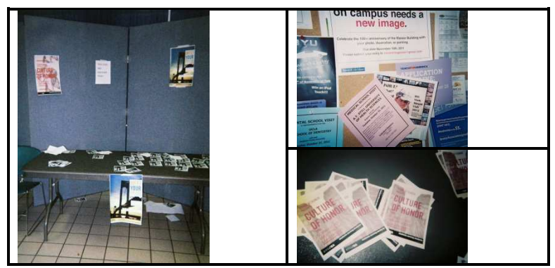
Figure 1 Ineffective Print Adverts

Flyers, although used heavily used across campus, were rated as the most ineffective means of advertising. Students commented "I only read them if I have absolutely nothing else to do" or "I shove them in my pocket and throw them away later."