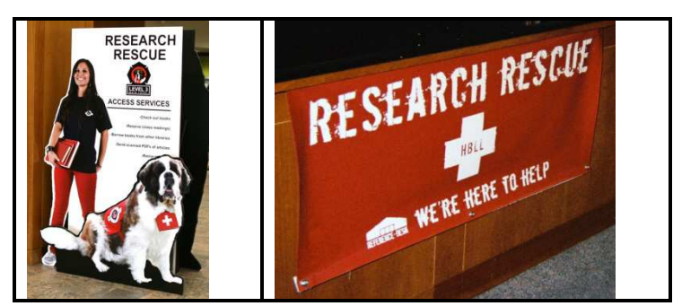
Figure 5 Research Rescue

The second response included students in the library's multimedia unit creating videos that encouraged students to study in the library which have been very popular with the students. These are posted on the library home page (www.lib.byu.edu) as well as on YouTube (http://www.youtube.com).