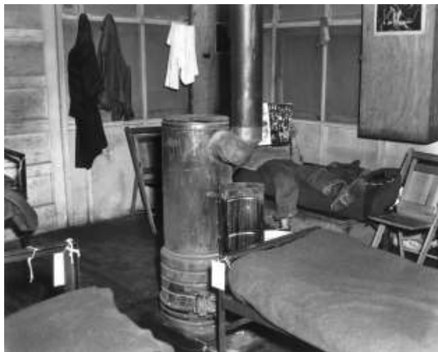
Figure 8. Hutment Interior (Westcott, c. 1943)