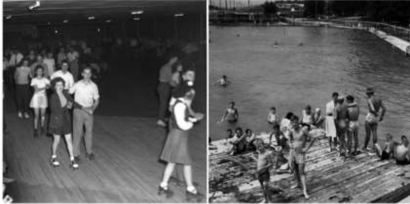
Figure 21. Roller-Skating Rink, Swimming Pool (Westcott, c. 1944)