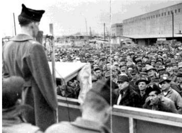
Figure 12. War Bond Rally, K-25 Plant (Westcott, c. 1944)

Another of his official photographic duties included developing prints from the classified negatives of other photographers, and in this capacity, he was the first person to view the classified military photographs of the destruction of Hiroshima and Nagasaki after the atomic bombs were dropped. When asked if he was shocked by the photos, and he replied, ‘Yes, of course ... the destruction was terrible’ (1999).