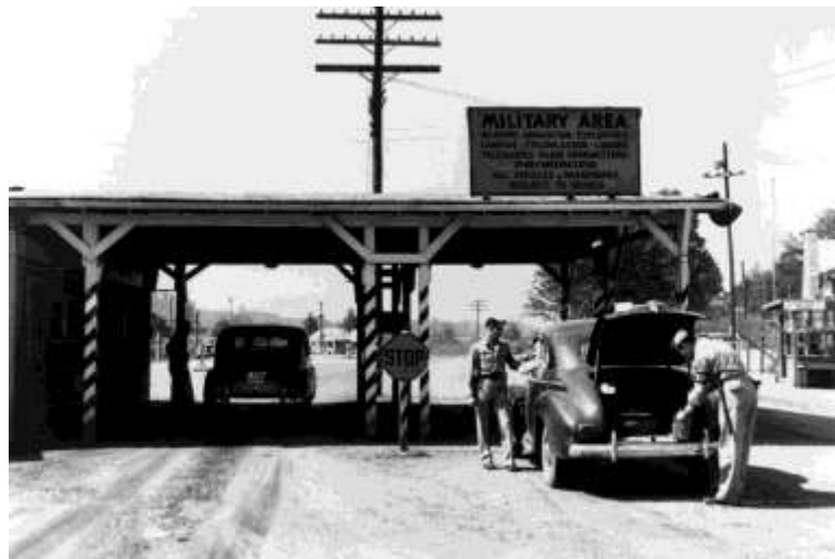
Figure 4. Perimeter Security Gate, Oak Ridge (Westcott, 1942)

Westcott was required to photograph exterior shots of every building at the CEW plant sites and interior shots of equipment and workers (Figure 5) unless the equipment was deemed too sensitive by Army Intelligence. One interesting shot depicts a group of young women operating the control panels in the Y-12 electromagnetic plant (Figure 6). These young women were trained to do a very specific job, without knowing they were producing uranium-235.