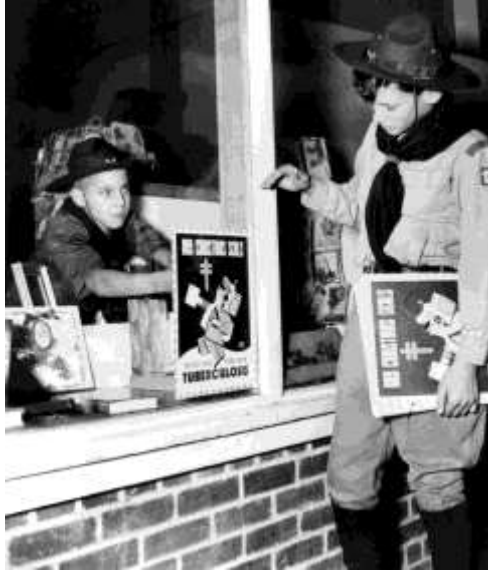
Figure 23. Boy Scouts with Christmas Seal Posters (Westcott, c. 1944)