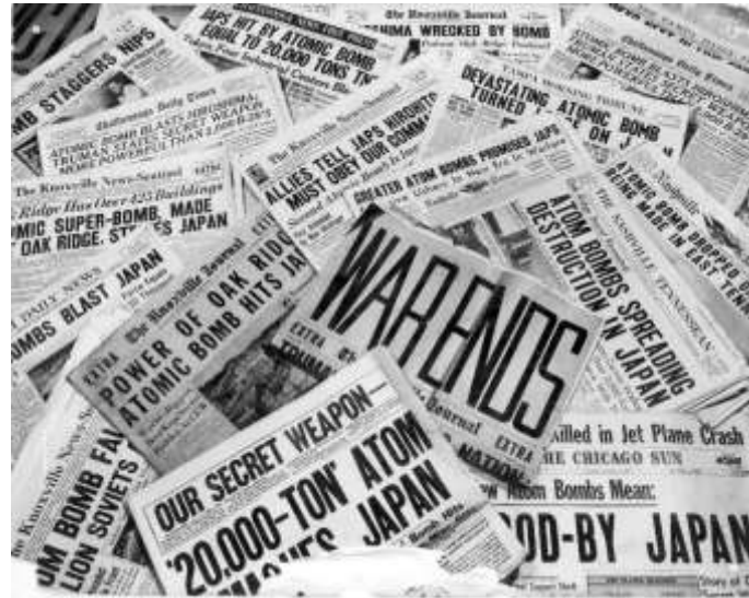
Figure 29. Newspaper Montage