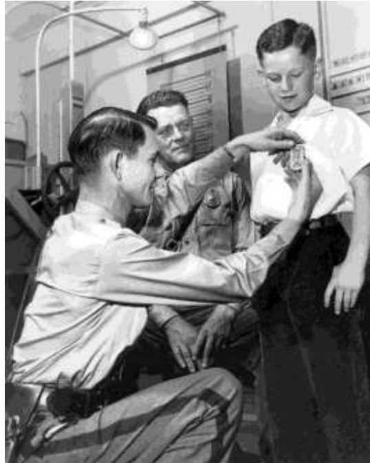
Figure 24. 12-Year Old Boy with First ID Badge (Westcott, c. 1943)