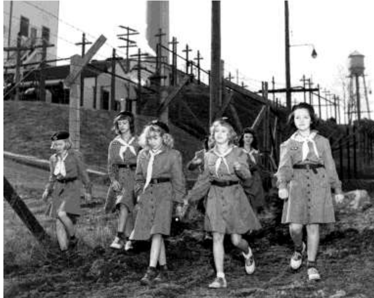
Figure 2. Girl Scouts near Reactor, Oak Ridge (Westcott, 1951)

Picturing the Bomb: Photographs from the Secret World of the Manhattan Project (Fermi, Rhodes, & Samra, 1995) includes forty-three Westcott photographs, a Westcott cover photo, and some biographical text. Fermi interviewed Westcott for the book, which contains photographs of all three Manhattan District sites, as well as Tinnian Island (air base for the Enola Gay), the Enola Gay and crew, and shots of the Hiroshima and Nagasaki explosions and aftermath.