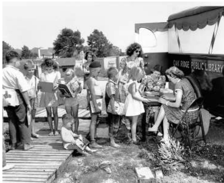
Figure 15. Public Library Bookmobile (Westcott, c. 1944)

Westcott's photographs of long lines at the grocery and of cars stuck in the mud are evidence of the frontier conditions that existed in the early years (Figure 16).