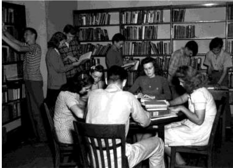
Figure 14. High School Library, Oak Ridge (Westcott, c. 1944)