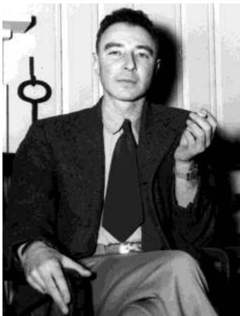
Figure 9. Dr. Oppenheimer, Oak Ridge Guest House

The VIP's and high-ranking officials who visited Oak Ridge during the war years stayed in the Oak Ridge Guest House. An image of one visitor, Dr. Oppenheimer, taken at the Oak Ridge Guest House is a particularly fine portrait (Figure 9) and Westcott tells the story that before he could take the picture, he had to help chain-smoker 'Oppie' make change to purchase some cigarettes.