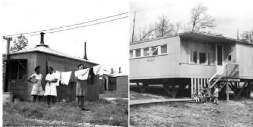
Figure 18. Housing for 'Colored' Family, 'White' Family (Westcott, 1940s)

Westcott's images document the segregation that existed in the 1940's – separate housing (Figure 18), schools, social events (Figure 19), even workers' outhouses (Figure 20).