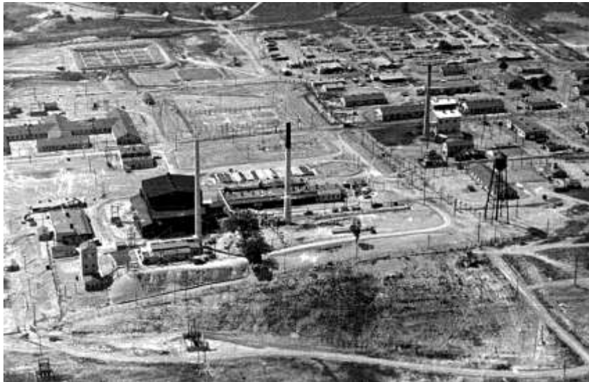
Figure 27. Aerial Photo of X-10 Graphite Reactor (Westcott, 1943)

designed and had made a 'wind hood' by the CEW metal-workers to fit the Speed Graphic camera for aerials. It was crafted of sixteenth-inch sheet metal with holes at the top and sides to attach to the camera with bolts and wing nuts. A heavier strip of metal was used in bracing the lower part of the hood under the camera. The hood was painted black, and proved to be a good sunshade as well as protection from the wind (Westcott, 1999).