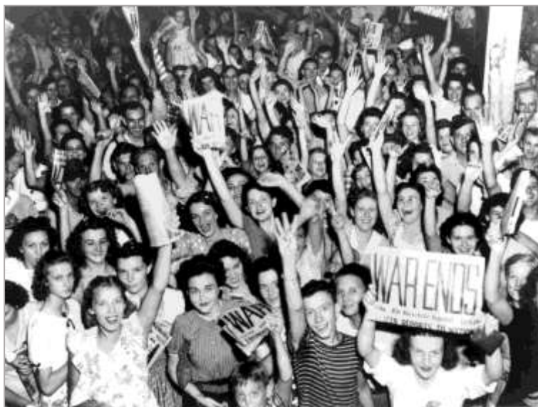
Figure 1. WAR ENDS (Westcott, 1945)

The special fiftieth anniversary 1992 issue of the Oak Ridge National Laboratory Review (Krause) credits the cover photo, the famous WAR ENDS image (Figure 1), to Westcott, but does not credit him with the other numerous photos within the text. Three notable monographs that feature his uncredited photographs are Now It Can Be Told: The Story of the Manhattan Project (Groves, 1962), The First Nuclear Era: The Life and Times of a Technological Fixer (Weinberg, 1994), The Making of the Atomic Bomb (Rhodes, 1986), Oak Ridge National Laboratory: First Fifty Years (Johnson & Schaffer, 1994), and City Behind a Fence: Oak Ridge, Tennessee 1942-1946 (Johnson & Jackson, 1981). The latter's cover image of girl scouts walking near the X-10 nuclear reactor was taken post-WWII, in 1951 (Figure 2). According to Westcott (1998), girl scouts would never have been allowed this close to the graphite reactor during the war years.