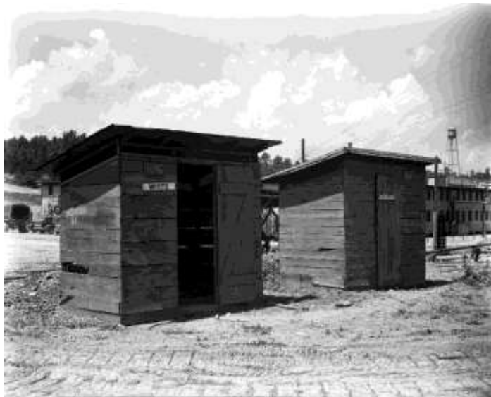
Figure 20. Separate Outhouses (Westcott, c. 1944)