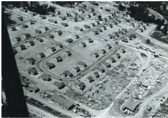
Figure 7. Aerial View of Prefab Houses (Westcott, 1944)

Many Westcott photographs of housing and living conditions at Oak Ridge were used to illustrate the book Dear Margaret: Letters from Oak Ridge (Present, 1980) and a few were used in the book Atomic Spaces (Hales, 1997).