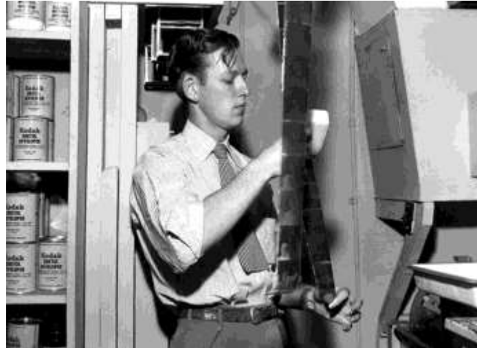
Figure 13. Ed Westcott, Oak Ridge Photo Lab (Westcott, 1945)