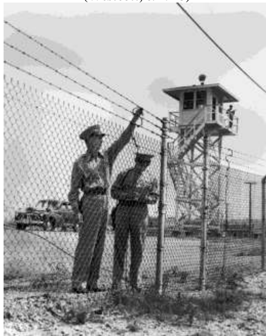
Figure 25. Security Fence and Guard Patrols (Westcott, c. 1943)