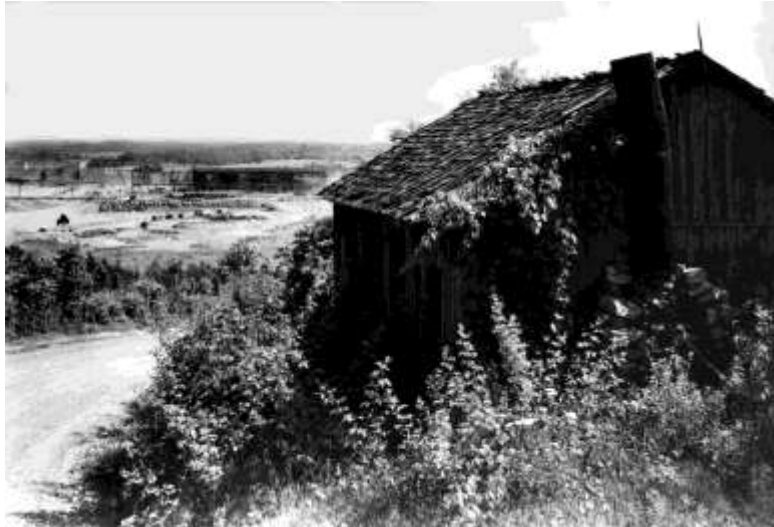
Figure 3. Cabin with Construction in Background (Westcott, 1942)