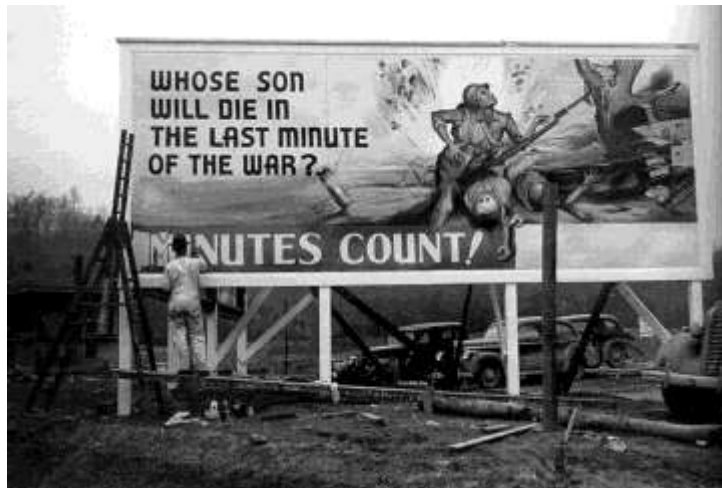
Figure 26. Oak Ridge Billboard (Westcott, c. 1944)

The tight security and patriotism of that era were evidenced by the billboard slogans that appear in many Westcott photos, such as ‘Whose Son Will Die in the Last Minute of the War? Minutes Count!’ (Figure 26), ‘If You Believe in Freedom, Work for It’, ‘What You See Here, What You Do Here, What You Hear Here, When You Leave Here, Let It Stay Here’, ‘Loose Talk Helps our Enemy’, and ‘Hold Your Tongue, the Job’s Not Done: Silence Still Means Security’. The Oak Ridge Journal ’s by-line read ‘NOT TO BE TAKEN OR MAILED FROM THE AREA’ and as mentioned earlier, every Westcott photograph to be published had to be approved (and sometimes censored) by Army Intelligence (Westcott, 1999).