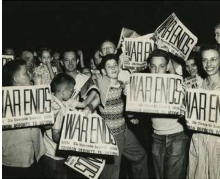
Figure 28. WAR ENDS (Westcott, 1945)

Westcott took another widely-published and historical shot later that evening when he returned home. He gathered as many newspapers as he could find, arranged them on his living room floor, and photographed them as a montage of V-J Day headlines (Figure 29).