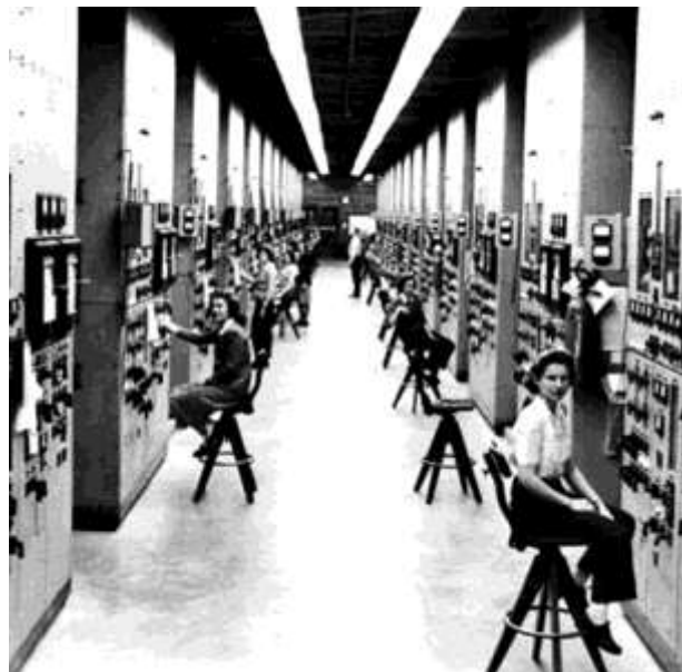
Figure 6. Women Workers at Y-12 (Westcott, 1943)