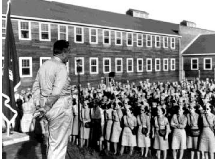
Figure 10. General Groves Addressing WACs (Westcott, c. 1943)

One of the most famous Westcott photograph of Groves is the July 1945 shot of General Groves looking at the map of Japan (Figure 11). Westcott was summoned to the Washington, D.C. office of General Groves for a series of photographs. In an interview in Popular Photography , he recounted, 'I arrived in Washington two days after General Groves witnessed the test in New Mexico, and of course I didn't know anything about it.