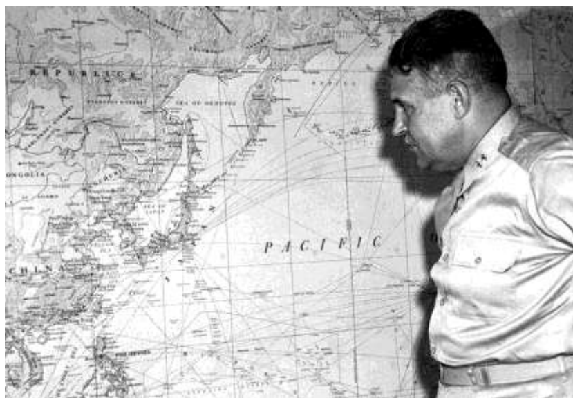
Figure 11. General Groves, Washington, D.C. Office (Westcott, 1945)