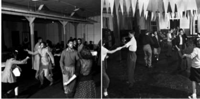
Figure 19. ‘Colored’ Teen Dance, ‘White’ Teen Dance (Westcott, 1940s)