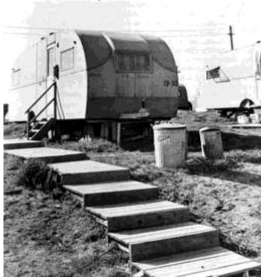
Figure 16. Trailer with Wooden Steps to Avoid Mud (Westcott, 1943)

Yes, we know it's muddy.... You think prices are too high in the grocery store.... Coal has not been delivered.... It takes six days to get your laundry.... The grocer runs out of milk and butter.... The post office is too small.... There are not enough bowling alleys... Your house leaks.... Everyone is not courteous.... It takes too long to get your passes ... The telephones are always busy.... You can't get all the meat you want.... Your house isn't ready.... There's confusion in the cafeteria.... The dance hall is crowded .... There's no soda fountain.... The guest house is full.... Employees are inexperienced.... You don't like the way things are run.... Things were different 'back home'.... You could do better.... You would have planned it differently. (Robinson, 1950, 54-55)