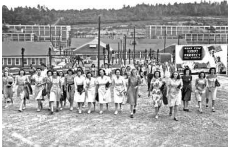
Figure 17. Workers Leaving Y-12 Plant (Westcott, 1944)