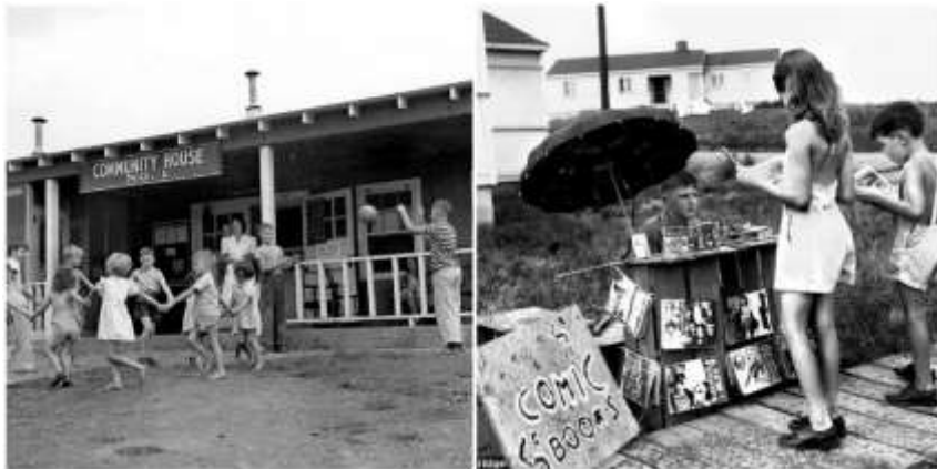
Figure 22. Community House Day-Care, Neighborhood Comic Book Stand (Westcott, c. 1944)