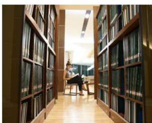
Figure 4 The second runner-up: Researching comfortably. Caption: The library provides easy access to the full text of theses and dissertations both in printed form and online. Being hard-working at the library can be accompanied by a relaxed atmosphere. Photo location: Thesis and Dissertation Service, the Central Library. Used by permission.

Qualities of library space shown in this photo: functional, adaptable, accessible, varied, conducive, environmentally suitable, and safe and secure.