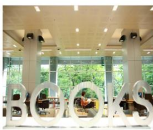
Figure 3 The first runner-up and popular vote award: The corner that relieves loneliness. Caption: It is another corner giving us reading happiness, pleasant surroundings, and facilities available for study. Photo location: Learning commons, the Central Library. Used by permission.

Qualities of library space shown in this photo: functional, accessible, varied, interactive, conducive, environmentally suitable, safe and secure, and oomph.