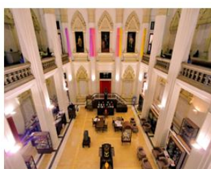
Figure 2 Winning photo: The origin. Caption: This beautiful and unique place brings back memories of being recognized as the first library in Chulalongkorn University, and it is supposed, from a user perspective, to exist forever. Photo location: The Humanities Information Centre's entrance hall. Used by permission.

40 photographs. Not only did they have a chance to use the descriptive approach for their visual content analysis, they also practised categorising and comparing the visual representation across the photographs. The qualities of good library space appeared in the photographs were specified by clearly defined descriptions that the two analysts could classify consistently. They therefore coded and counted the visual clues to understand the meanings of 40 photographs through the more precise, reliable identification of the image contents. Three figures below illustrate examples of the qualities of the library buildings decoded by the two visual analysts in this pilot study.