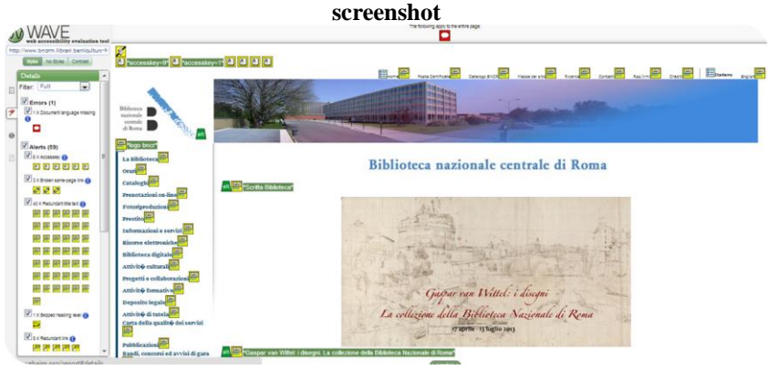
Figure 1. Validation by WAVE Web Accessibility Evaluation Tool {\color{black}\boldsymbol{-}}

The following print screen shows validator in action (see Figure 1). The panel on the left contains exemplary results of validation, which are divided into six categories: regular errors, alerts, features (improvements in accessibility), structural elements, HTML5 with ARIA and finally contrast errors.